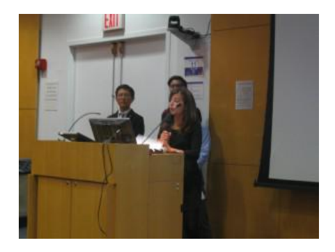
Students present their ideas for marketing Van Cleef & Arpels' bridal line in the U.S.